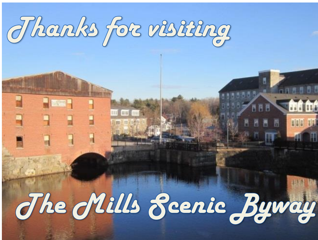
Newmarket Mills